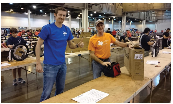
Back to Table of Contents